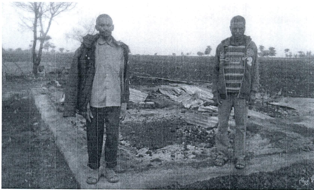
Sample pictures: Two farmers standing on the ashes of what used to be their houses. Oromia regional state of Ethiopia, west showa zone nano werda nano alo kebele August 2015.